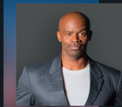
Michael Jr., Comedian